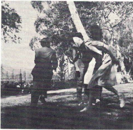
All English Professors have a bad time?