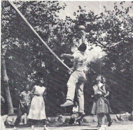
Think he'll make it? Hope nothing breaks!

The day began with a rousing baseball game between the upper and lower classmen—and as much as we hate to admit it, the underclassmen came out on top! As the spectators cheered them on, not far away a volleyball game was in progress.